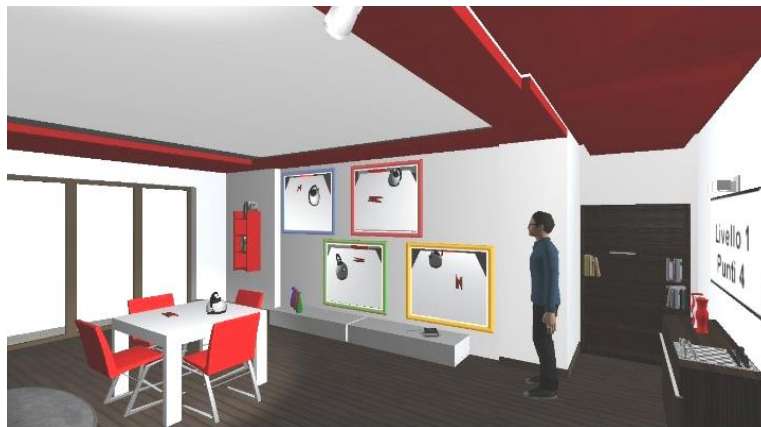
Figure 2: The In Your Eyes game

In Your Eyes takes place in a virtual home environment. The player, at the beginning of the game, is standing in front of a table on which some objects have been placed. He is always free to move, explore the room he is in, and observe the scene on the table from any possible angle, just as if he were in a real world. Only when he is ready to play will he decide to tell the avatar to start the game.